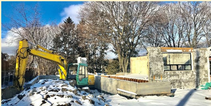
Construction continues with footings poured at this site

We will continue this series and update on what happens in our next issue.