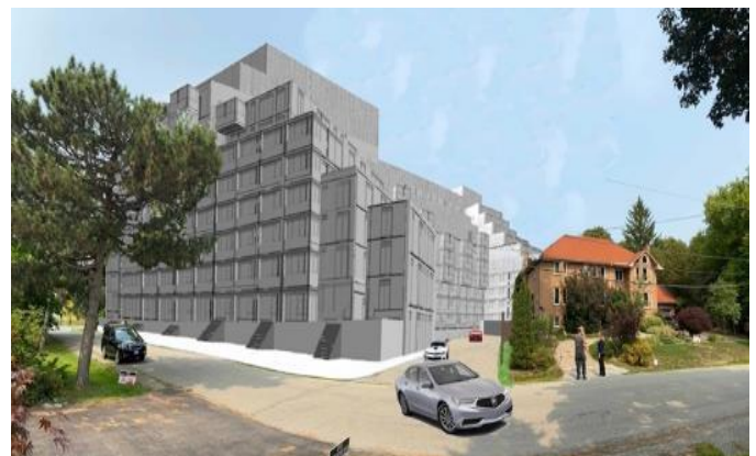
Condo exit directly across from 3 Windy Ridge Drive – artist impression

The intent of the document was to provide City Planning with a real sense for how the residents and visitors are currently experiencing life in our well-established neighbourhood, and to present the many significant concerns the Association has with the current development application, which is nowhere close to a “fit” to the existing physical character of the neighbourhood and neither sensitive nor gradual to the area.