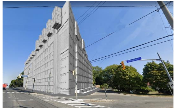
Looking from south west corner of Kingston & Ravine – artist impression

A 36-page document indicating concerns and opposition to the LCH Condo Proposal was submitted to City Planning. In particular opposition to the proposed amendments of the Official Plan and rezoning of 2 and 4 Windy Ridge Drive. The proposal is in conflict with the City's own Avenues and Mid-Rise Buildings Study, the City's Official Plan, infill requirements in neighbourhood policies, and with the Growth Plan for the Greater Horseshoe among other concerns.