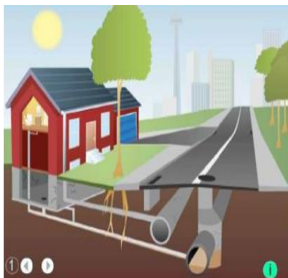
Separated sewer systems have two pipes: sanitary sewers and storm sewers.