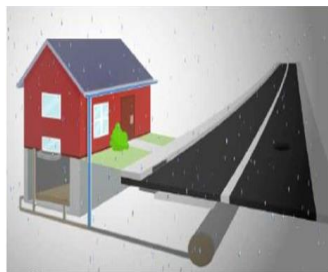
Combined sewer systems have one pipe.

The good and bad paving of driveways/hard landscaping of front yards: