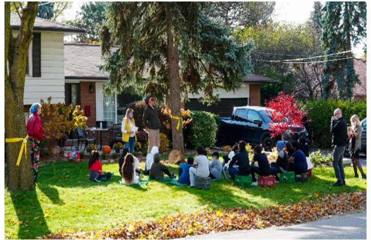
Students from Bliss Carman Public School getting a lesson on the benefits of trees In November of 2020 the Grade 7 Class of Bliss Carman Senior Public School visited 3 Windy Ridge Drive and were given a lesson about the benefits of trees while sitting on the front lawn. They were

The Tree Ribbon Campaign was launched by the Cliffcrest Scarborough Village SW Residents Association to bring attention to the neighbourhood forest at risk of being lost if the decisions made about these neighbourhoods do not give consideration to the value of our trees.