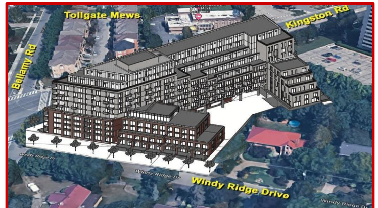
images artist impression