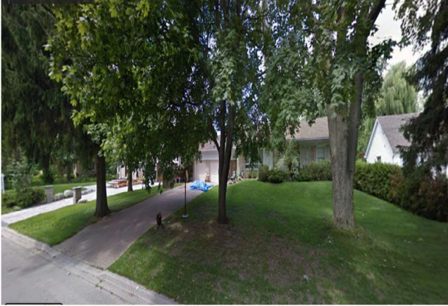
Treed lot preconstruction