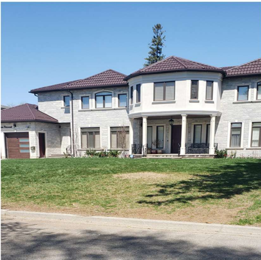
Large luxury house without any trees on the lot